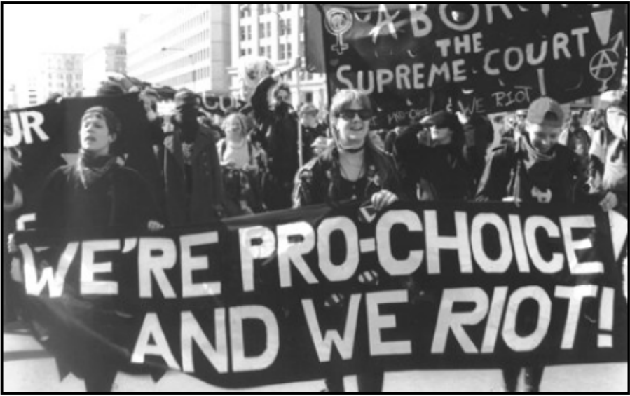
Anarchist contingent at "March on Washington for Reproductive Freedom"

broader social movements became more apparent.