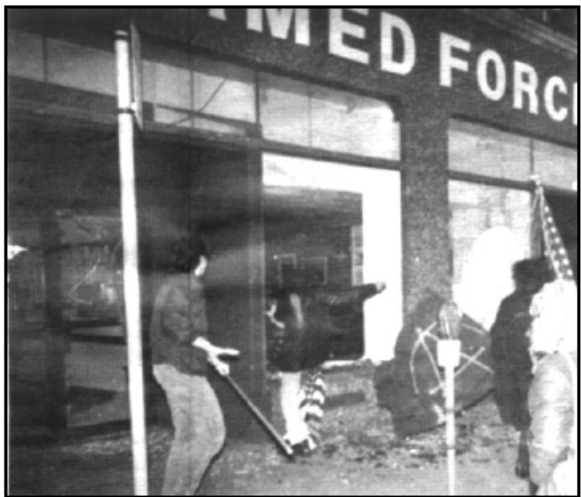
Anarchists attack recruiting center, Minneapolis

On March 17, 1988 the U.S. sent 3,200 troops to Honduras in apparent preparation for an invasion of Nicaragua. The response to this action was massive. In every major city and in hundreds of towns people took to the streets. The actions were militant. In countless cities government buildings or offices were occupied in sit ins. In those cities with strong Central America movements like San Francisco, Minneapolis, Toronto, and Boston demonstrations attacked government buildings, breaking windows and fighting with the police. The demonstrations went on day after day for a week until Reagan announced that the troops would be brought home. In all of the most militant