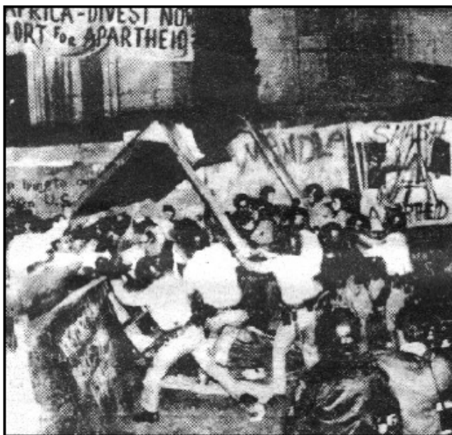
UC-Berkeley divestment shantytown attacked, early 1980s

In the spring of 1985 major demonstrations broke out on campuses across the U.S. demanding that the various colleges and universities sell off, or divest, their stocks in corporations doing business in South Africa.