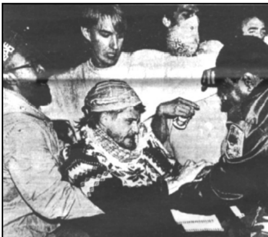
Anarchist unarrest at pentagon blockade

The Pentagon blockade was originally called by the Committee in Solidarity with the People of El Salvador (CISPES) and the Pledge of Resistance as an action against the US support for the right wing Salvadoran government. As at Langley there were two distinct conceptions of the blockade. The New York and Washington DC leaderships of CISPES and the Pledge basically wanted a symbolic civil disobedience and therefore planned a legal rally and a civil disobedience at a single entrance of the Pentagon. The anarchists (taking for this single action the name Mayday Network of Anarchists), the Progressive Student Network, and a number of local CISPES and Pledge groups influenced by the militancy of the Honduras actions wanted to engage in "mobile tactics" blocking access to the Pentagon parking lot and avoiding arrest as long as possible to prolong the actual disruption of work at the Pentagon.